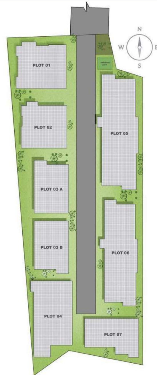
OVERALL SITE LAYOUT