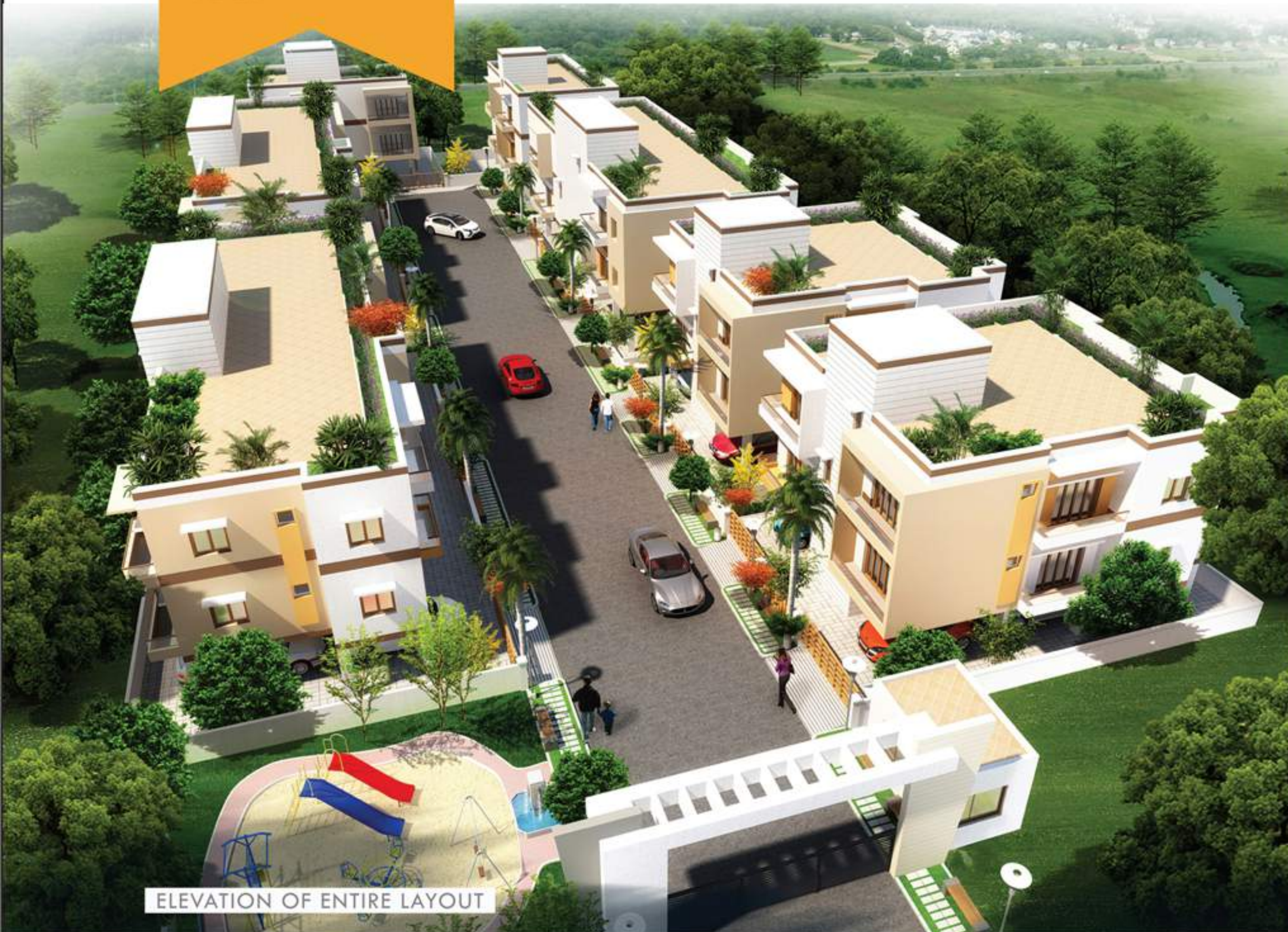
ELEVATION OF ENTIRE LAYOUT

Diya Constructions Pvt. Ltd. is proud to present their newest residential project in Korattur situated just 5 minutes away from Anna Nagar. This community consists of 40 beautiful apartments spread over more than half acre of land. As one of the first gated communities with complete security and great amenities in Korattur, our project will be a landmark in the area.