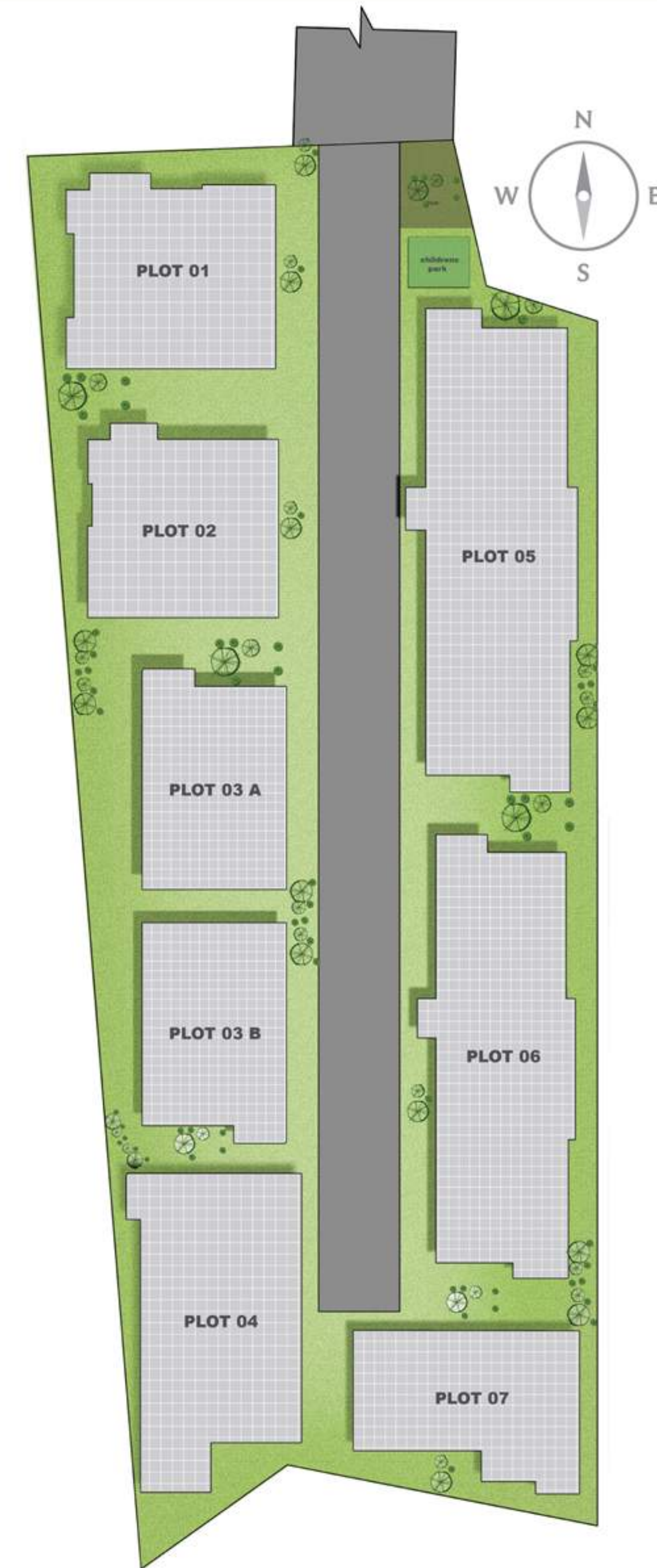
OVERALL SITE LAYOUT